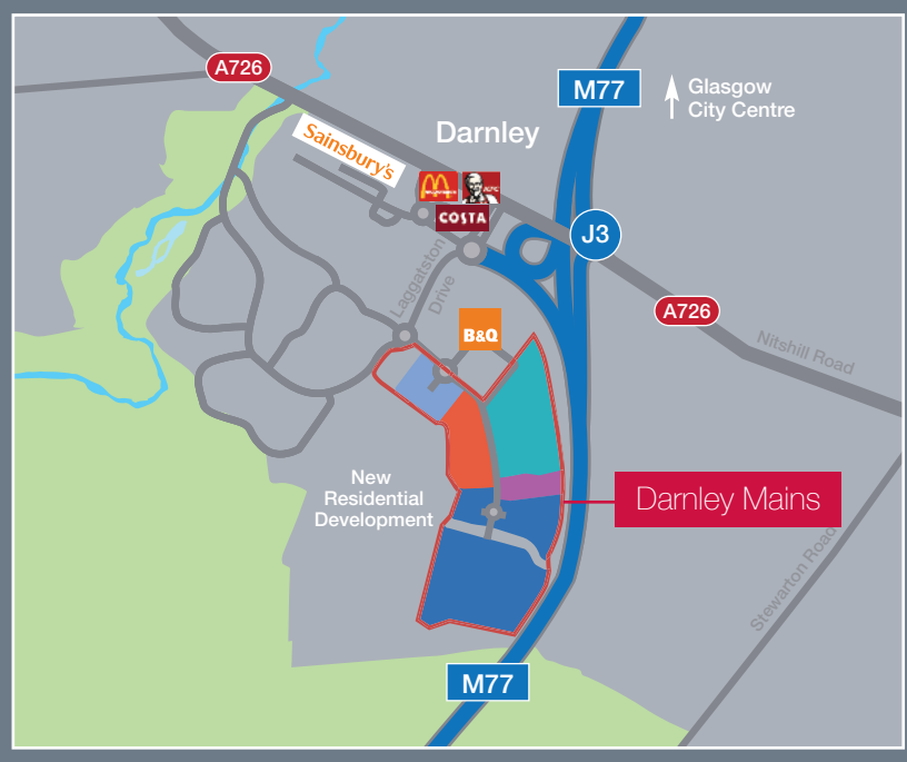
All maps and plans are for indicative purposes only